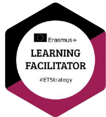
Open Badge Example